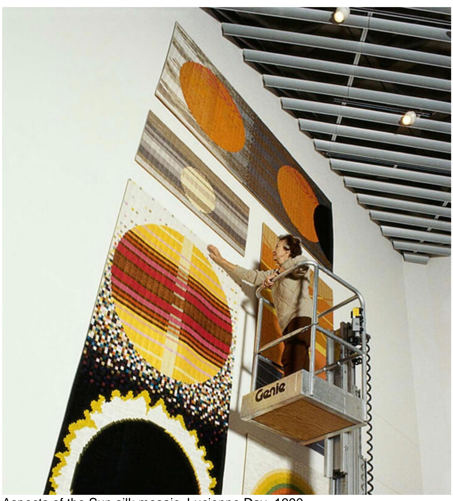
Aspects of the Sun silk mosaic, Lucienne Day, 1990