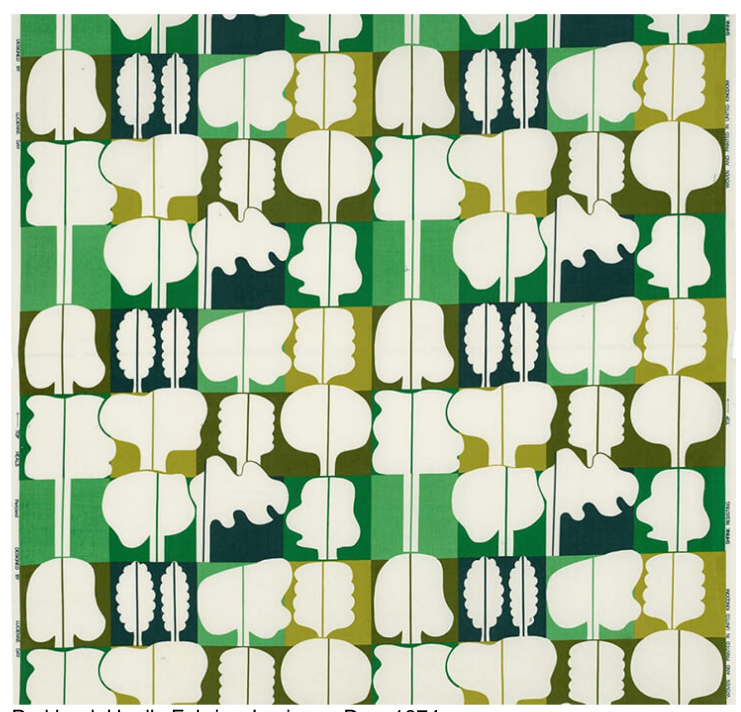
Parkland, Heal's Fabrics, Lucienne Day, 1974

Throughout the 1950s Day's designs became ever more radical and stylised, featuring quasi-botanical forms with linear, drawn elements and flattened