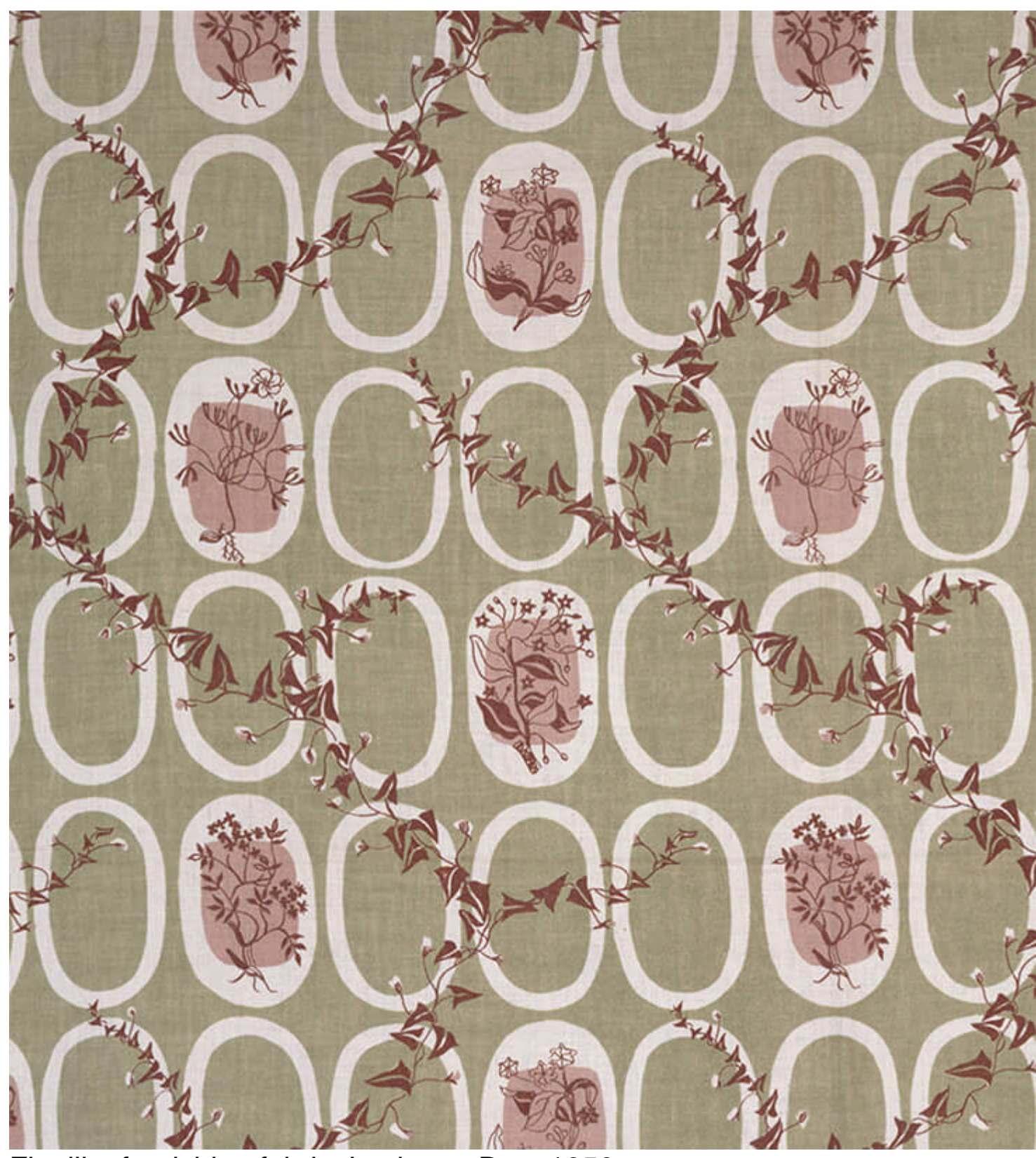
Fluellin, furnishing fabric, Lucienne Day, 1950

Day was born under the name Desiree Lucienne Conradi to an English